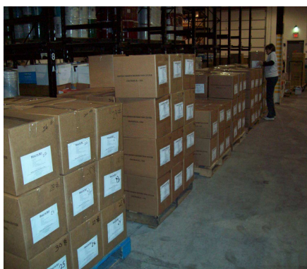
Health kits packed and ready to go at the Midwest Distribution Center

All monetary donations should be designated for Advance #418325 . Contributions can be sent with your monthly remittance, made online or mailed to: UMCOR, PO Box 9068, New York, NY 10087.